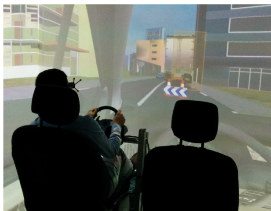
Figure 1: P2I CAVE Driving Simulator

The methodological tool used in this experiment is one of Renault's CAVE, an Immersive Integration Platform (P2I), with 4 display surfaces (3m x 2.5m). It allows virtual stereoscopic vision from the tracked position (thanks to ART Tracking), with a resolution of 1024 x 768 per face. A static Driving Simulator was installed in the middle of the P2I CAVE to conduct the presented experiment. Virtual information were embedded in the driving scene through the driving simulation software SCANeR, it gave the impression that Augmented Reality Information was projected on a virtual plane between the vehicle cockpit and the driving scene. The next vehicle in the same lane, and the left lane (for cars coming on the opposite direction), were framed by an adaptive bounding box. Two bounding boxes in maximum are framed simultaneously.