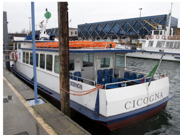
Figure 4 (right). View of the stern of Cicogna moored in the shipyard of Navigazione Laghi in Arona, March 2014.

During the winter, ferries operate on reduced service and are subject to seasonal maintenance.