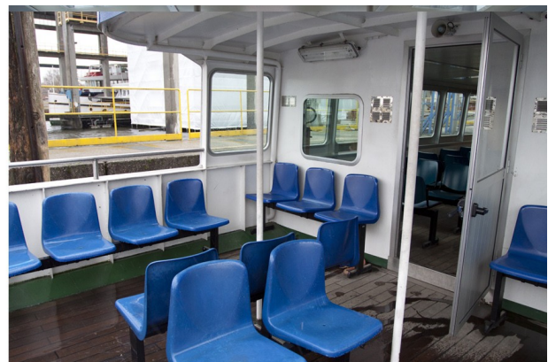
Figures 12 and 13. Open passenger areas on the prow (left) and on the stern (right). On the right picture, the door coaming is clearly visible. The pictures were shot during maintenance operations in the shipyard.