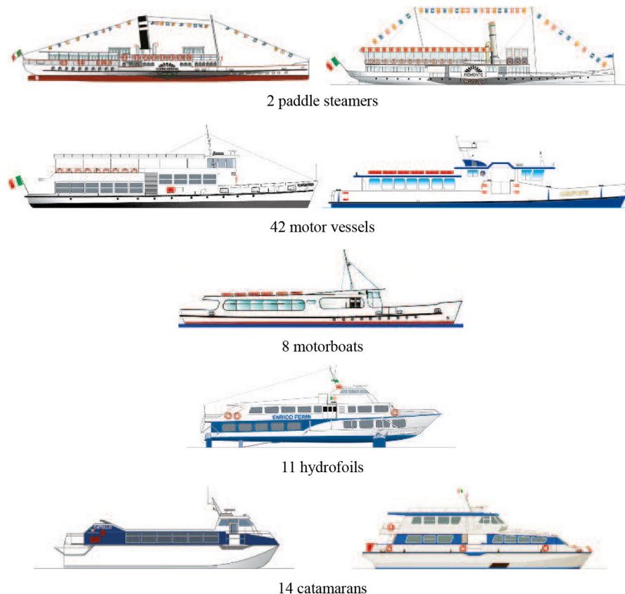
Figure 1. The fleet of passengers-only ferries of Navigazione Laghi.

The network counts 105 stopovers, shared in the following way: 25 in the Italian part of Lake Maggiore and 11 in the Swiss part; 27 stops in Lake Garda; and 42 in Lake Como.