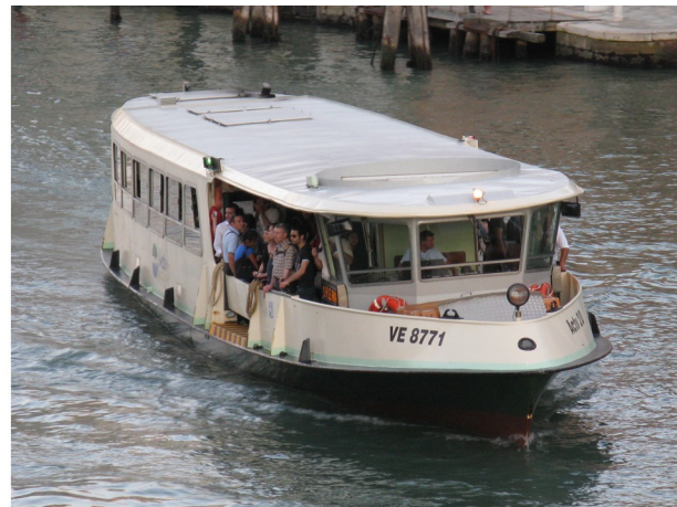
Figure 14 (left). ACTV series 80. Figure 15 (right). ACTV series 90.