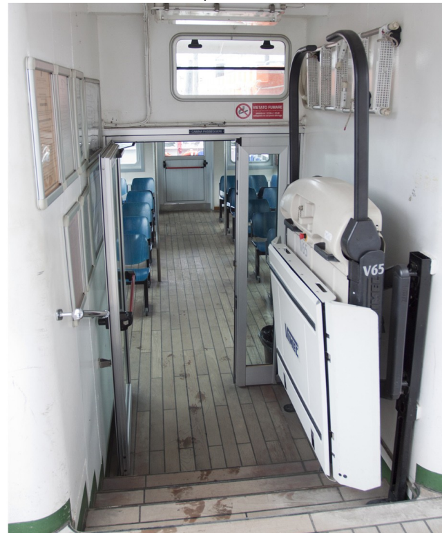
Figure 9 (right). Steps from the entrance area to the main cabin, equipped with a stairlift. The pictures were shot during maintenance operations in the shipyard.