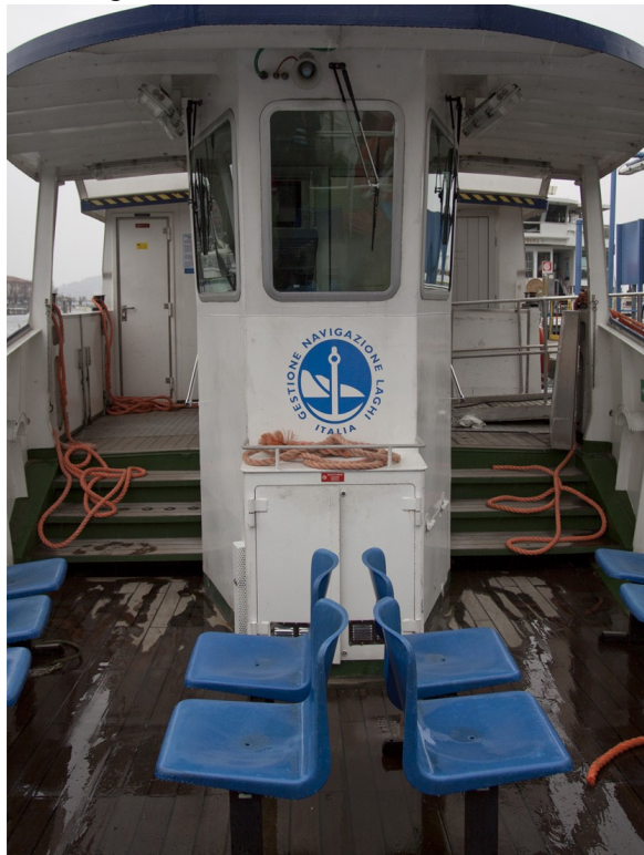
Figure 8 (left). The control cabin and the two side stairs which lead up to the entrance area.

All the stairs are provided with handrails. Because of the stairlift, the main stairs have a single handrail on the right side. Prow stairs have a handrail on the side of the control cabin and the other on top of the bulwarks.