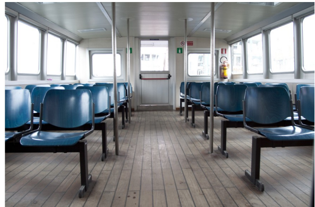
Figures 10 and 11. Shot and countershot of the main cabin area.