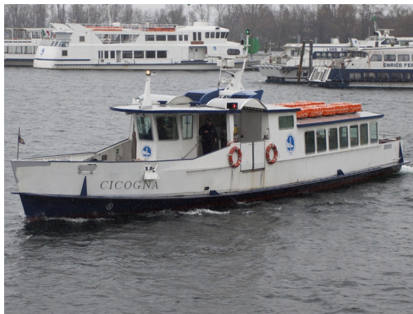
Figure 3 (left). General view of the ferry Cicogna leaving the shipyard of Navigazione Laghi in Arona, March 2014.

The ferry chosen as a case study is a 24 m passenger unit named Cicogna , which is operated in Lake Maggiore. The ship is interesting for different reasons: because of its small size, which highlights accessibility issues; because she is one of the newest of the entire fleet, so it should display the most up-to-date solutions; and because she is part of a series of ten identical vessels, thus representing 10% of the whole fleet of Navigazione Laghi. The series is called Airone , from the name of the first unit. All the ferries were built for Navigazione Laghi between 2008 and 2011 by Cantieri Navali di Chioggia-Ravenna. Four units are assigned to Lake Maggiore: Airone , Albatros , Cicogna , and Pellicano . Four are operated in Lake Como: Cormorano , Fenicottero , Grifone , and Civetta . Finally, two are allocated to Lake Garda: Sparviero , and Condor .