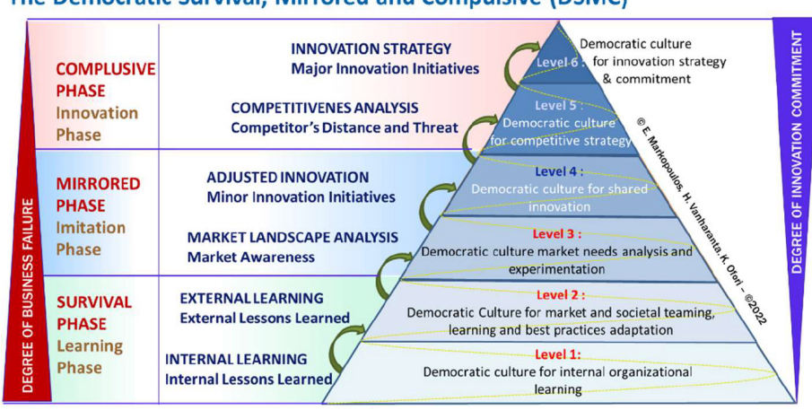
The Democratic Survival, Mirrored and Compulsive (DSMC)

The integration between the two models is done in a paired way (see Figure 2). The Survival Phase is implemented with the first two levels of the adjusted Company Democracy Model. The Mirroring phase is implemented with levels 3 and 4, and the Compulsive phase with levels 5 and 6.