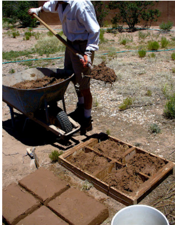
Figure 2: ARKIPLUS (n.d.). Molding adobe bricks [online]. Available at: https://www.arkiplus.com/bloques-de-adobe/ (accessed 22 February 2022).

is added. Since bricks are made from the soil found in the site, the composition can vary but on average it's been found that is 10 to 15% clay, 10 to 15% silt and 70 to 80% sand with 25 to 30% of water. (Diamil, 2015).