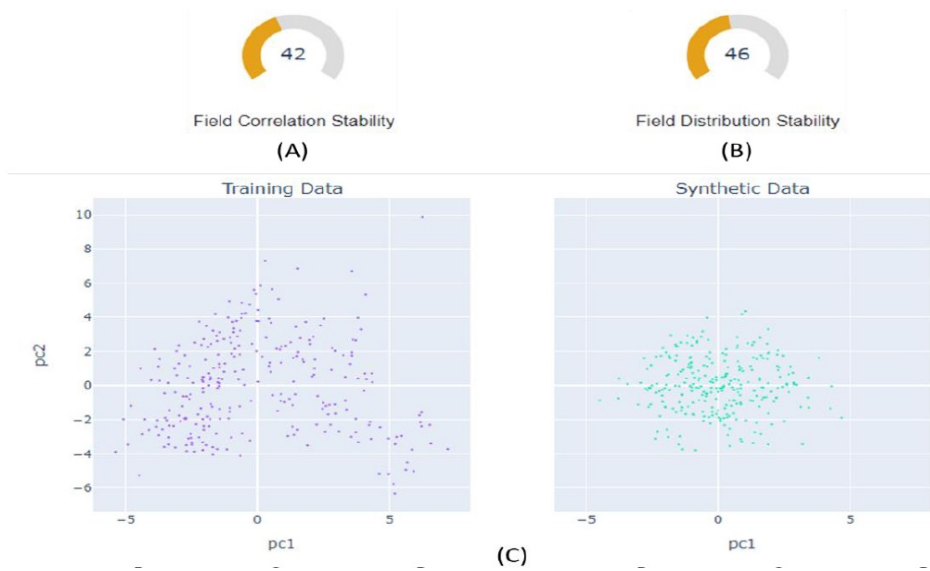
Figure 3: (A) Field correlation stability (B) field distribution stability (C) principal component analysis (PCA) of the real (training) and synthetic data of ACTGAN model respectively.

to accurately emulate the characteristics of real data underscore potential shortcomings as a generative model within the considered framework. Notably, the Field Distribution Stability, as illustrated in image B of Figure 3 and further corroborated through PCA in image C, reveals a discernible disparity in the distribution patterns when contrasted with the real dataset. This observation suggests a notable incongruity in the distributional characteristics between the synthetic and authentic datasets, indicating potential challenges in maintaining fidelity during the synthetic data generation process and capturing the inherent structures of the original dataset.