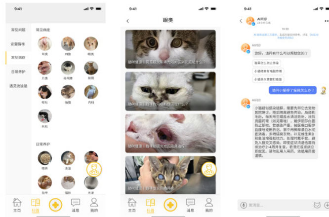
Figure 5: Interface design for digital education and AI-assisted diagnosis.

Transparent Donation and “Cloud Adoption” Visualization: To alleviate financial anxiety, the system converts users who cannot adopt pets into “online supporters.” Users can donate to specific cats, with funds tracked via a real-time data dashboard (covering sterilization/surgery/treatment). By linking donations to a cat’s dynamic footprint on a digital map after release, the system reshapes social trust and sustains emotional engagement.