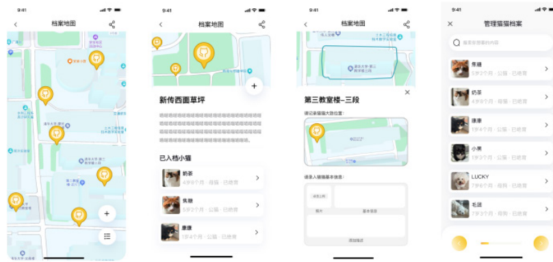
Figure 3: Community cat profile and map interface design.