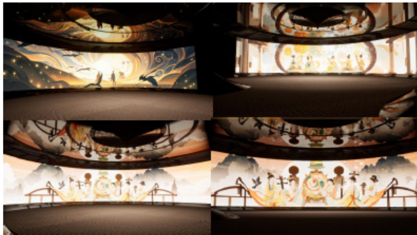
Figure 4: Conceptual exhibition hall for Nanyin culture.

Following the same steps as above, the authors generated numerous exhibition hall renderings using AI and selected those that met the requirements for 3D modelling. The authors imported the images into Unreal Engine 5 (UE5) to demonstrate the interactive exhibition hall effect. UE5 can significantly enhance visual effects and interactive experiences while optimizing overall performance, enabling a contemporary presentation of traditional culture. UE5's Lumen global illumination system can simulate real-time light reflections and dynamic changes, such as light penetrating bamboo shadows in a Minnan courtyard and subtle reflections on bird feathers in the morning light. These details endow the exhibition hall with a high degree of immersion. Figure 4 shows the rendering effect of the AI-generated video displayed in the UE venue.