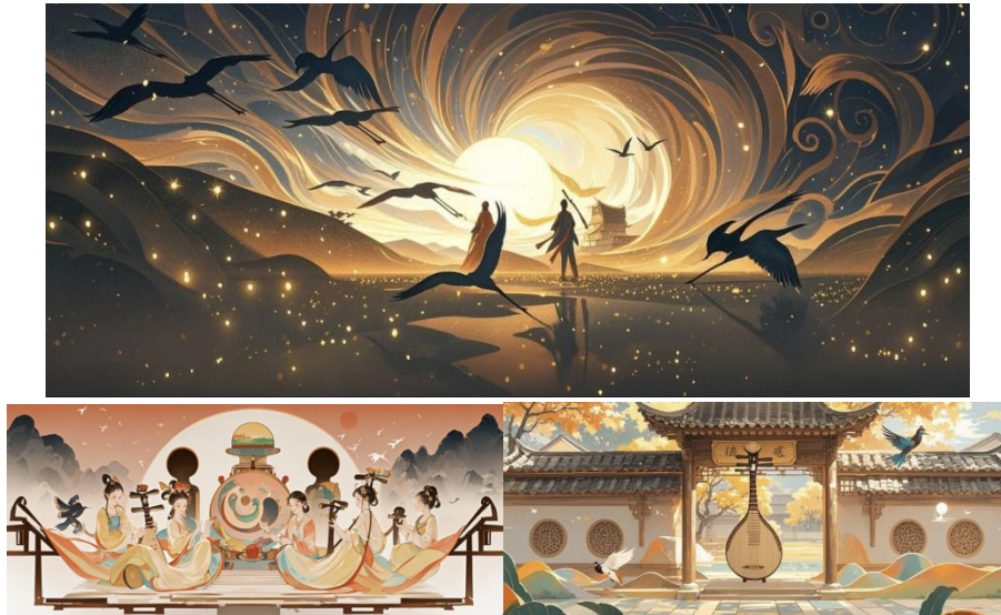
Figure 3: Storyboard images by Ji Meng AI.

The second step is scene creation. In Ji Meng AI, the authors described the content and visual effects of each generated shot through its storyboard creation function. After that, the authors ensured the smooth connection of the entire storyline and generated each storyboard image. After completing the organization, the authors used the tool's image-to-video function to combine the images and describe the generated scenes and actions to complete each fragment video. Take one of the storyboard scripts as an example: Shot size: Wide shot. Scene: Night sky projected on the dome, with stars twinkling, and the dawn light slowly rising, accompanied by the clear sound of the Nanyin flute. Effect: The light gradually brightens, and the silhouettes of birds fly across the scene, symbolizing the beginning of the prologue. The author added a description of the scene: Traditional Chinese warm color tones, abstract graphic style, Chinese elements. These prompts were input into the tool together, and the first storyboard image was finally generated. By analogy, the AI tool assisted the author in creating more storyboards (See Figure 3).