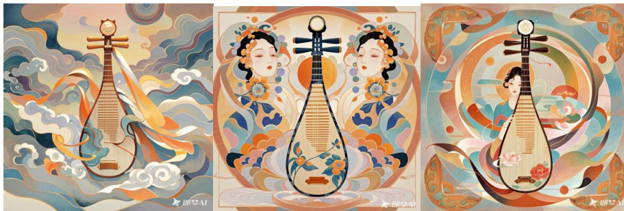
Figure 2: Design of Pipa symbol by Ji Meng AI.

traditional Nanyin elements, such as musical scores and instrument forms, into Ji Meng AI. Subsequently, the authors specify clear requirements for composition, style, color, and other aspects to refine the generated images. Taking the pipa symbol as an example, the authors first imported a pipa image as a reference and then entered relevant prompt words. If the aim was to obtain an abstract planar pipa graphic element with Minnan regional characteristics and traditional Chinese color schemes, the following prompt words were entered: Symmetrical composition, pipa, abstract, traditional color palette, warm colors, elegance, Minnan culture, planar composition, symbolization, tenderness, Chinese elements, ink-wash style, and high saturation. This was used to generate the images. Subsequently, the authors made local modifications to the generated images or added keywords for multiple iterative generations. Finally, with reference to traditional elements, the author adjusted the design draft details. Eventually, the design drawing of the pipa-element symbol was created (See Figure 2).