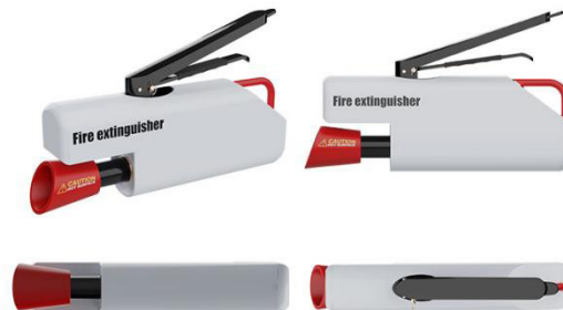
Figure 3: Final rendering of handheld fire extinguisher.

Final Rendering. The design rendering of the handheld fire extinguisher is shown in Figure 3.