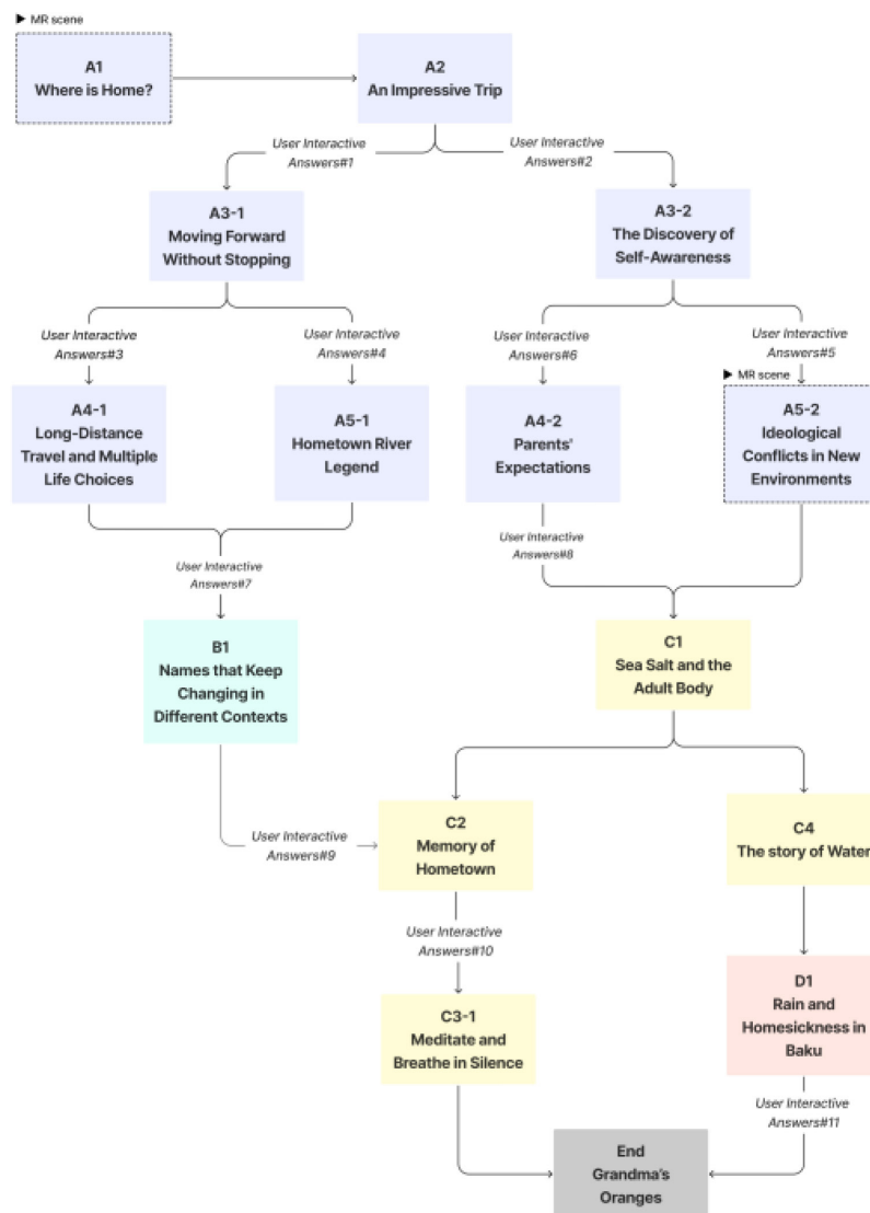
Figure 2: Multi-path narrative structure of Ideal Home. Each color-coded path represents a distinct narrative unit (A–D), composed of multiple scene nodes, each shown as an individual block.

to the thematic and emotional goals of each scene. These strategies included dialogic prompting, which positioned the audience as a virtual interlocutor to shape tone and addressivity; stylistic conditioning, which introduced poetic, metaphorical, or rhythmical cues to enrich narrative voice; and content blending, which recomposed narrative fragments from multiple immigrant accounts to generate dialogues reflecting shared themes while preserving individual distinctions. This approach aligns with recent practices in modular and collaborative human–AI scriptwriting (Lu et al., 2023). Finally, the generated scripts were iteratively reviewed and refined by the authors across multiple rounds. Revisions focused on semantic coherence, emotional authenticity, and cultural appropriateness, until consensus was reached on the final scripts.