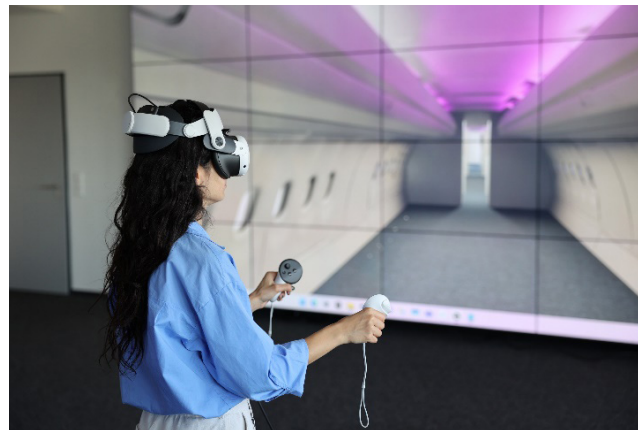
Figure 3: Participant learning the controls in the empty cabin 'Level 0'.

To introduce the VR application, Level 0 placed participants in an empty cabin (see Figure 3). Here participants familiarised themselves with the controls and experimented with basic interactions. Once this was complete, the first scenario began.