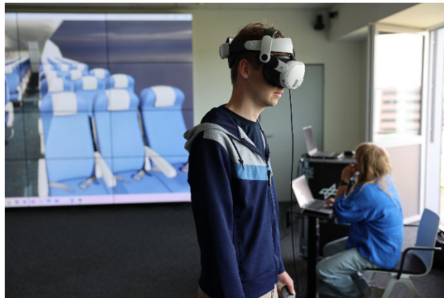
Figure 2: Room setup showing a participant in VR while the experimental supervisor observes and records their responses on a laptop.

The study was conducted over two consecutive days in the year 2025. The study room was equipped with a large screen on which the VR application was displayed in real time. This allowed the experimental supervisor to observe the movements and interactions of the participant continuously (see Figure 2).