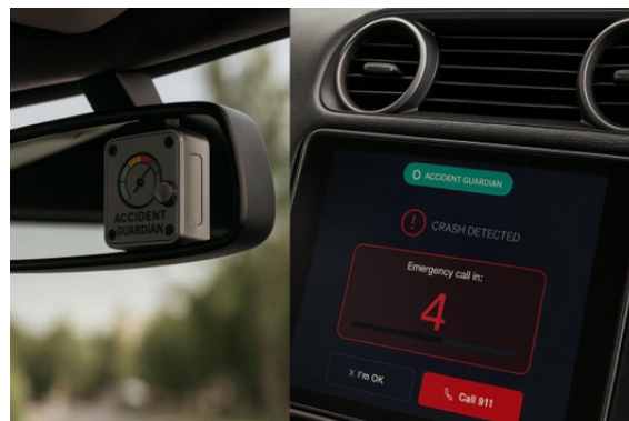
Fig. 3: Final integrated prototype of the accident guardian system.