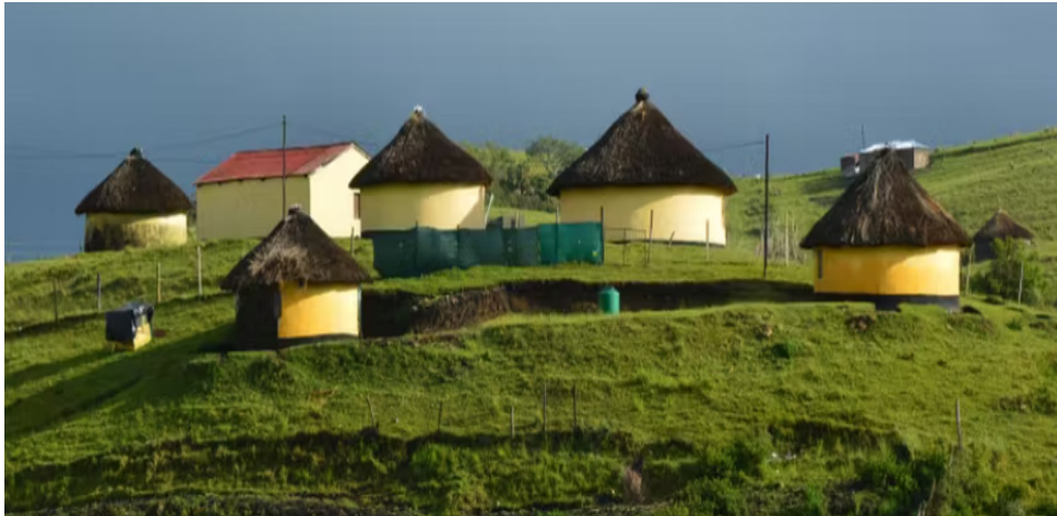
Figure 1: Indigenous circular housing units illustrating earthen wall construction, thatched roofing and symbolic geometric decoration typical of Southern African vernacular architecture.

housing typologies. South Africa's housing sector continues to prioritise rapid delivery and uniformity, often at the expense of climatic responsiveness and cultural relevance (Department of Human Settlements, 2019, Mahachi, 2022). Conventional housing models rely heavily on energy intensive materials and layouts that frequently perform poorly in local environmental conditions.