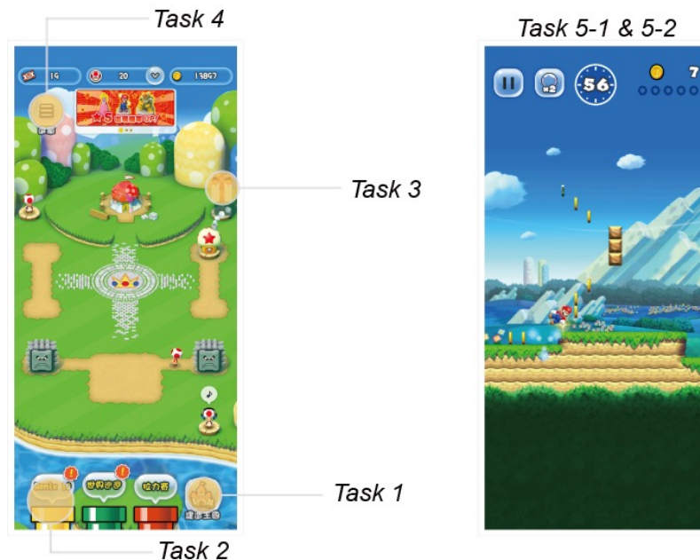
Figure 2: Screenshots of the task interfaces.

Before the experiment, participants were informed about the study background and objectives and then completed a demographic questionnaire and an informed consent form. The experimental procedure and task operations were subsequently explained. After finishing all tasks, participants completed a subjective usability questionnaire (SUS) and took part in a semi-structured interview to elaborate on their interface usage experiences.